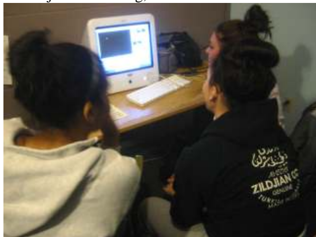
Video Voices students edit at MTN.

Please let us know what you think about these changes, and any other suggestions you might have. You can send an e-mail to jakre@mtn.org , or talk to one of us at MTN.