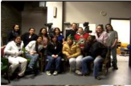
Above right: Get Ready students work in MTN's iMovie lab to edit their project. Left: Get Ready students work on camera, in the edit systems and in the studio to create their program.